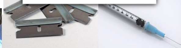
HYPODERMIC NEEDLES AND RAZOR BLADES

Sharp metal presents a hazard for WWTF employees. These items can penetrate protective gear, exposing staff to bacteria, pathogens, or medication.