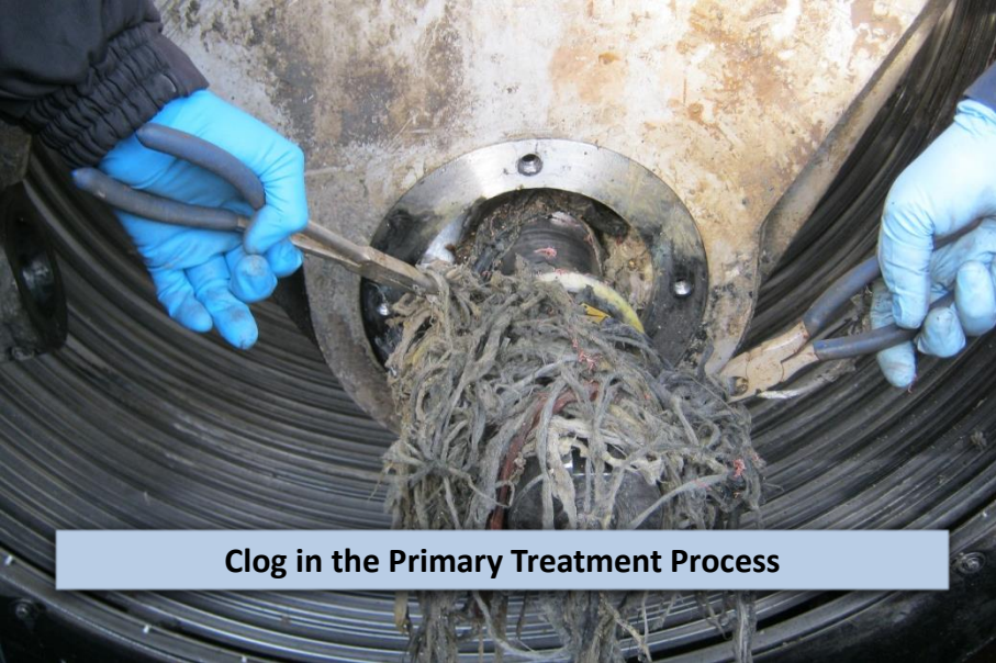
Clog in the Primary Treatment Process

These items can clog the system, causing a sewer backup into your or a neighbor's property. The bio organisms at the wastewater treatment facility breakdown organic matter and cannot breakdown plastics or metal.